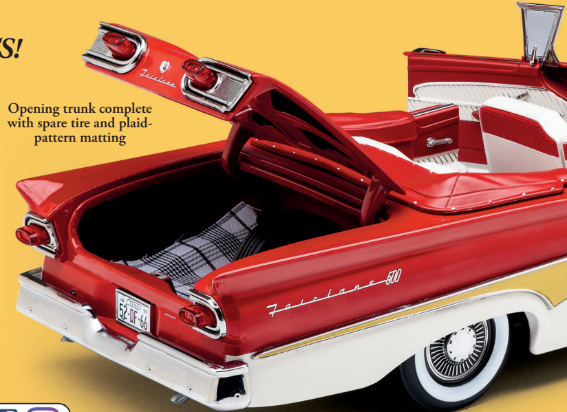
Opening trunk complete with spare tire and plaid-pattern matting

EXCLUSIVE FOR HAMILTON CLIENTS! "1958 Ford Fairlane 500 Sunliner" 1:18-Scale Die Cast